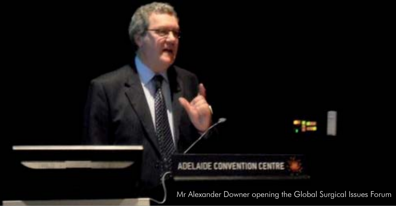
Mr Alexander Downer opening the Global Surgical Issues Forum